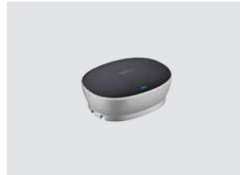
CONNECTIVITY AND USAGE